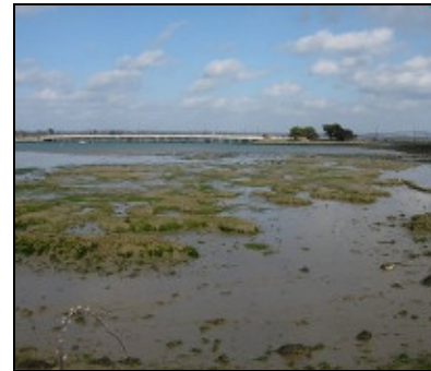
Mudflats by The Hayling Billy Path