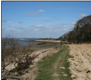
Langstone Harbour