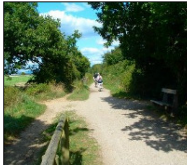
Hayling Billy Coastal Path