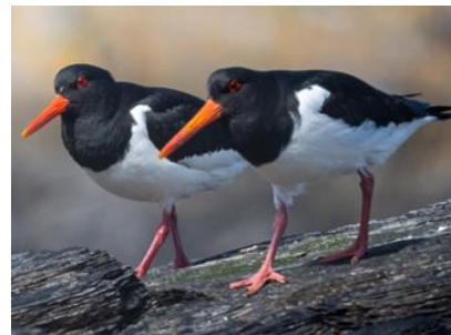
Two Oystercatchers walking down large ridge rock

The Thorney Island Scheme will support and benefit numerous habitats and wildlife in the area, to raise awareness of this we will be highlighting a different species each month. This month it is the Oystercatcher, it is a widespread breeding bird in northern England and Scotland but in southern England and Wales they are restricted to the coast. The Oystercatcher is our only wading bird that is black and white with an orange beak.