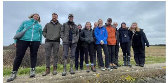
Thorney Island Project Team

The Thorney Island Project Team have a wealth of experience between them and is made up of colleagues from the Environment Agency, JBA Consulting and Chichester Harbour Conservancy.